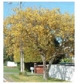
Sophora chathamica .