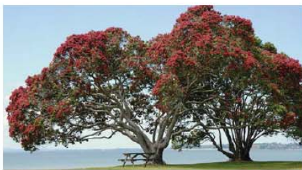
Metrosideros excelsa