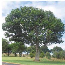
Vitex lucens .