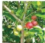
Vitex lucens .