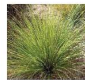
Carex virgata .