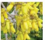
Sophora chathamica .